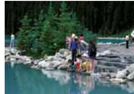
LAKE LOUISE RIVER BANK