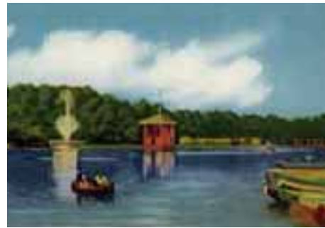
HISTORIC ORTHOPHONIC DEVICE AND FOUNTAIN